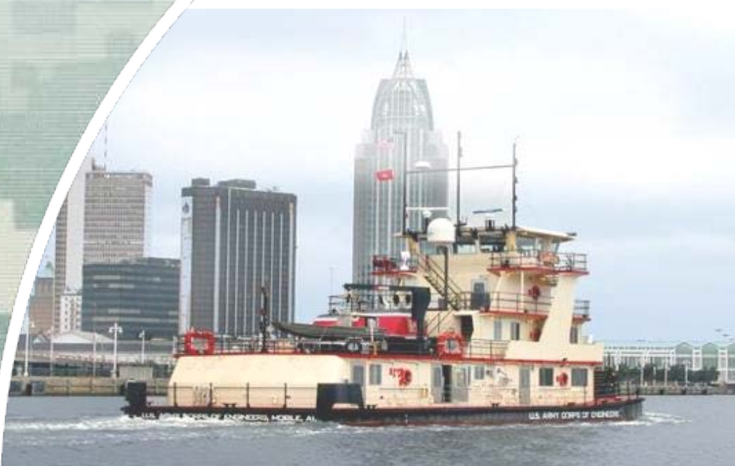
MV Lawson heads up Mobile River enroute to commissioning in Tuscaloosa